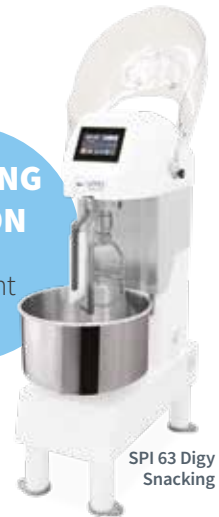
SPI 63 Digy Snacking