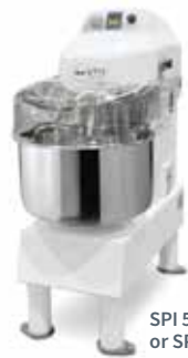
SPI 53 S or SPI 63 S