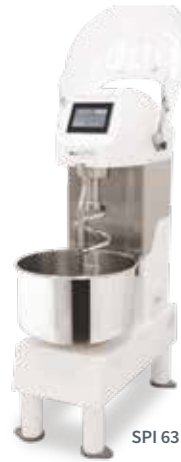
SPI 63 Digy